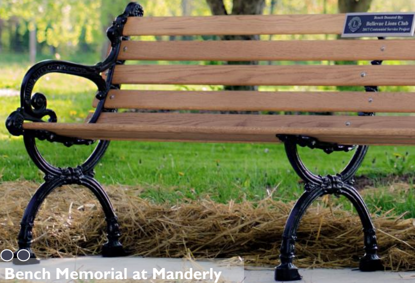
○○○ Bench Memorial at Manderly Way Trailhead ○○○