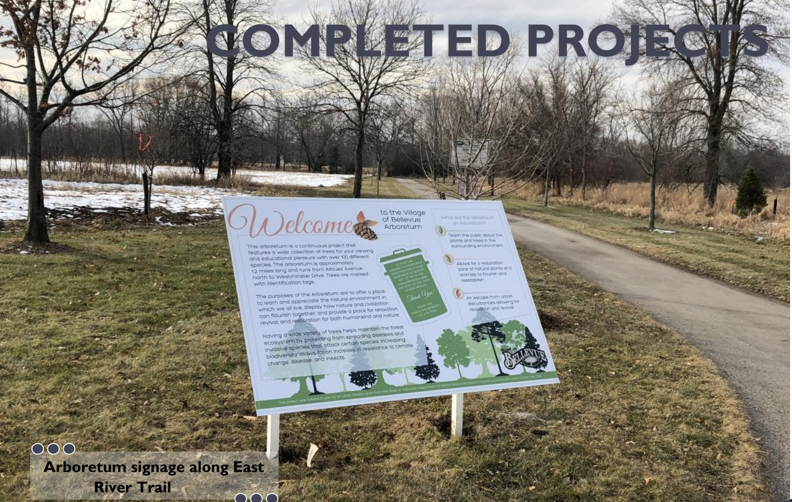
●●● Arboretum signage along East River Trail ●●●