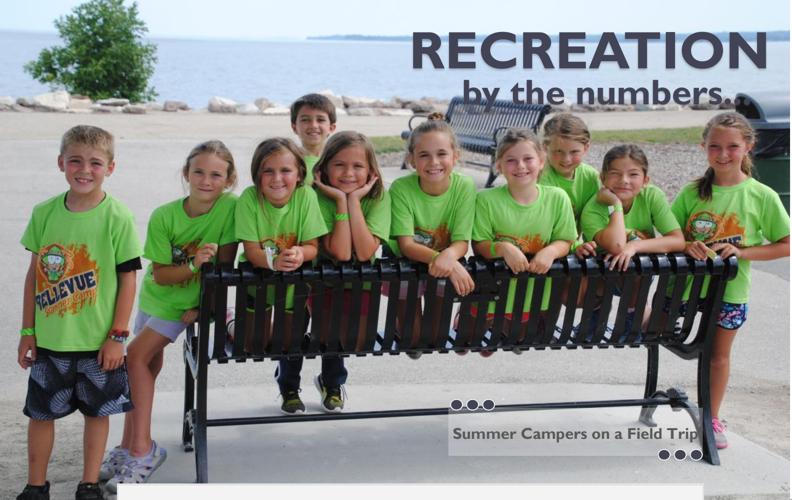
Summer Campers on a Field Trip