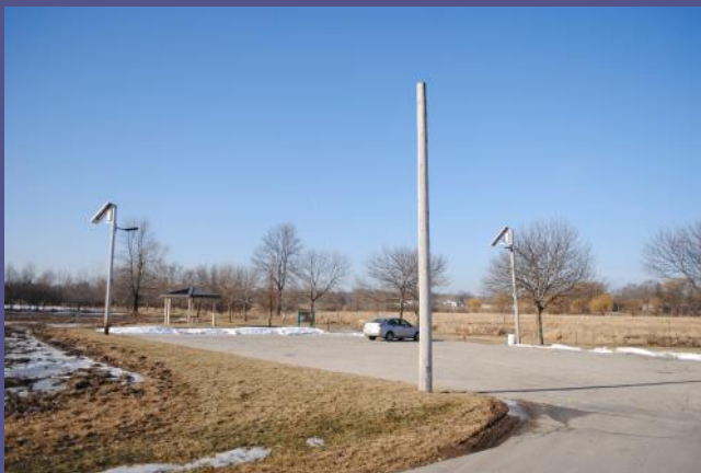
Westminster Drive Before