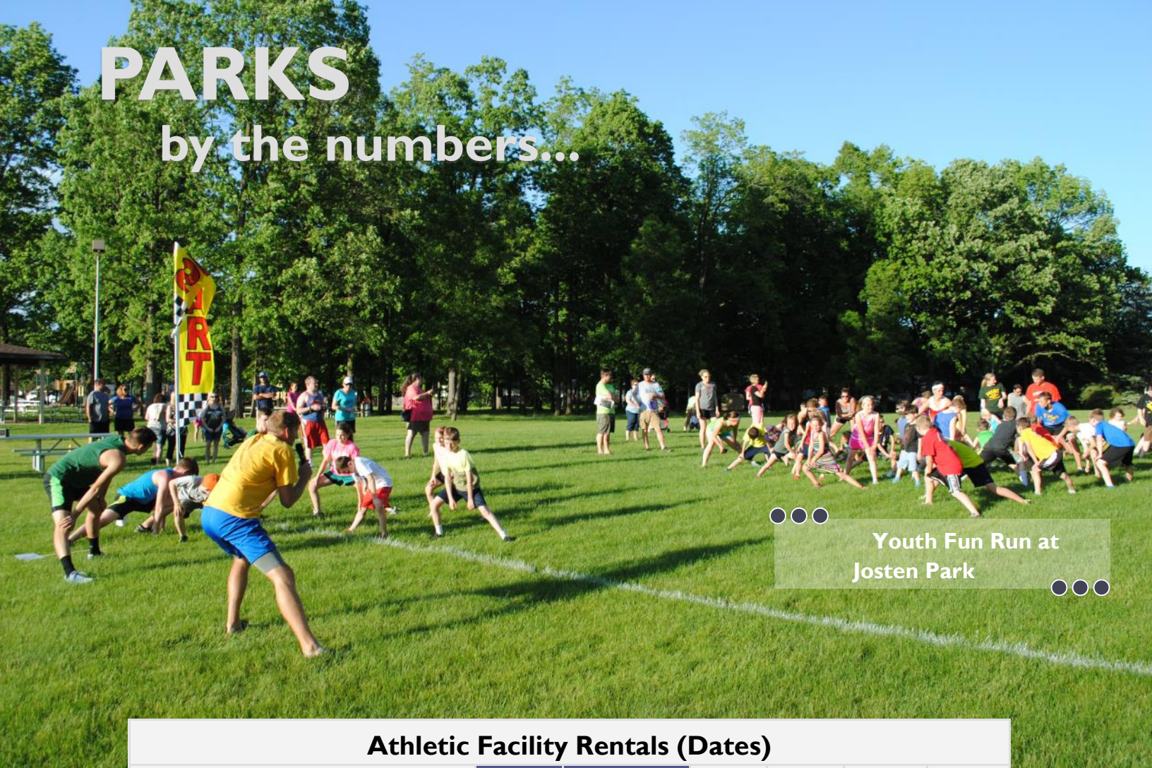
● ● ● Youth Fun Run at Josten Park ● ● ●