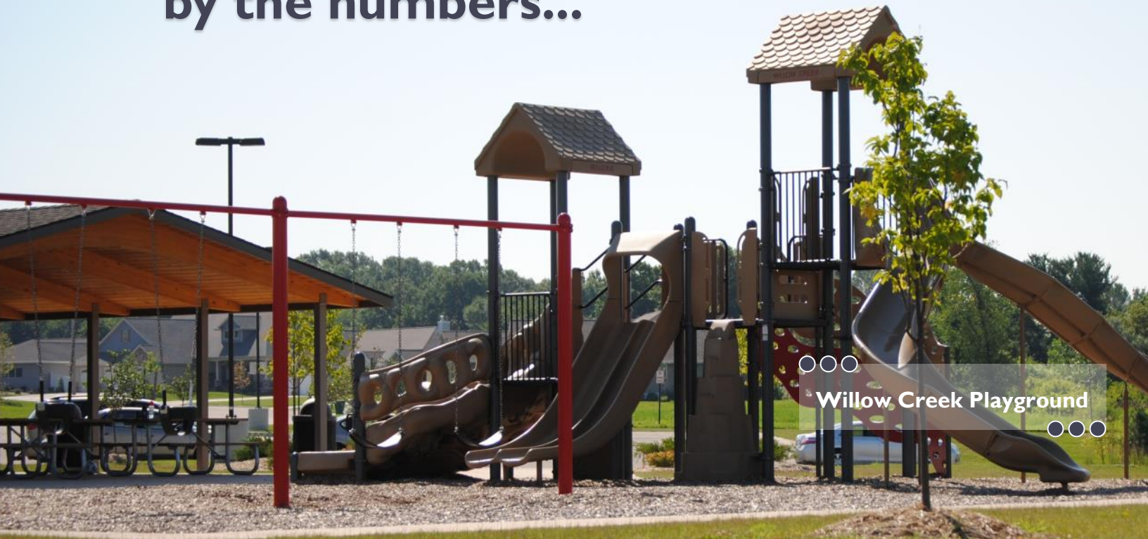
Willow Creek Playground