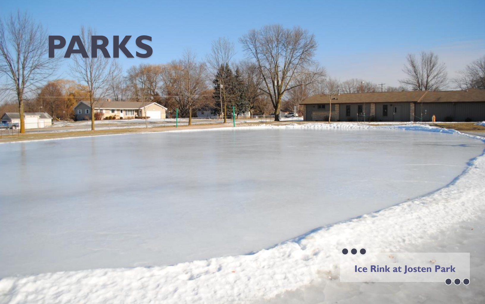
● ● ● Ice Rink at Josten Park ● ● ●