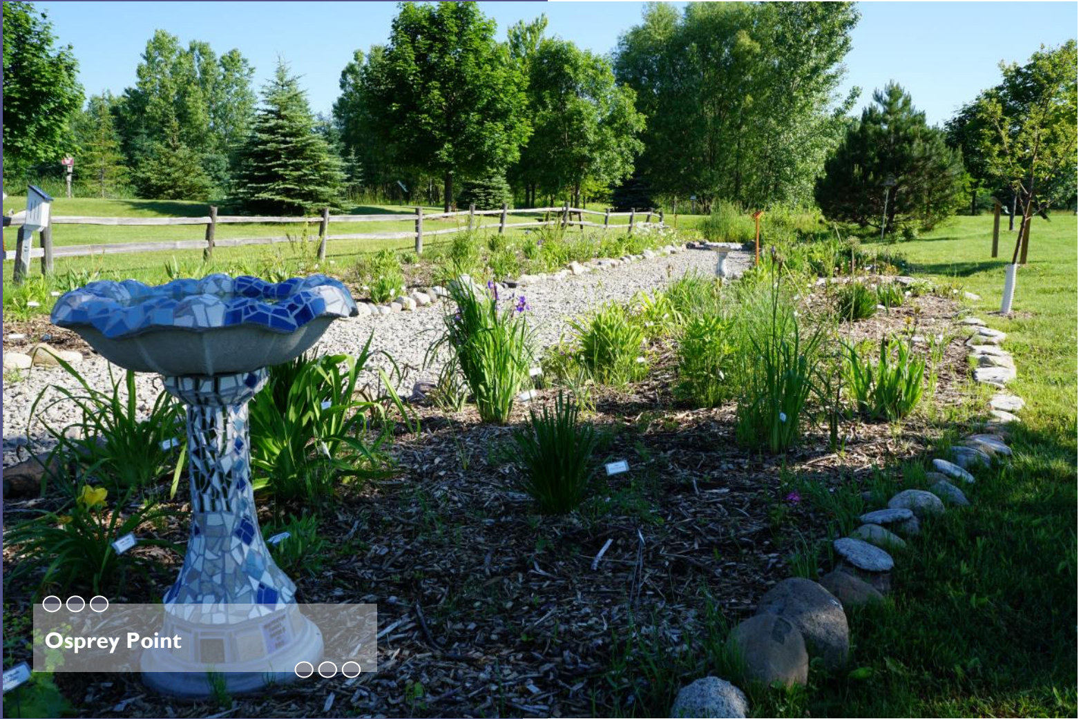
○○○ Osprey Point